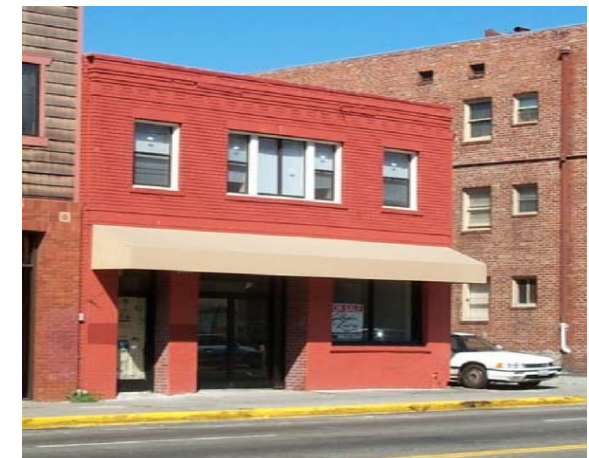
After Façade Improvement