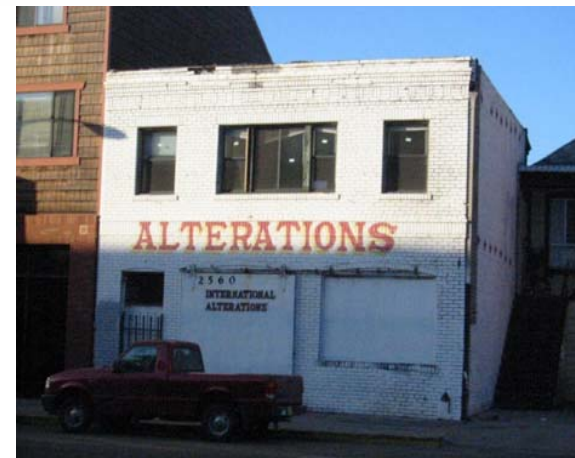
Before Façade Improvement